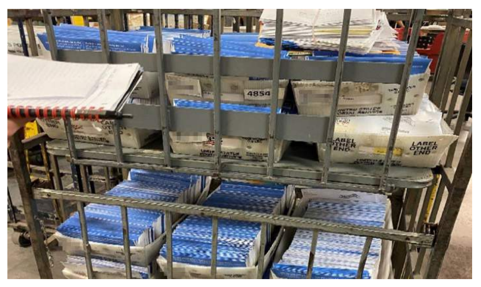
Figure 2. Example of Outdated Voter Addresses