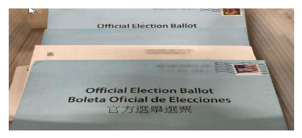
Figure 1. Example of Ballot Return Envelope with No Address